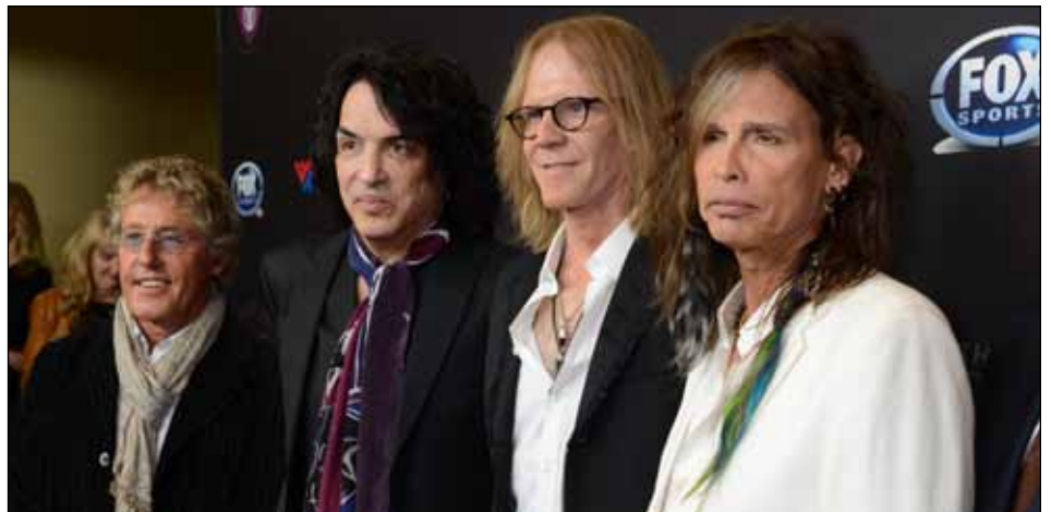
Roger Daltrey, Paul Stanley, Tom Hamilton, Steven Tyler