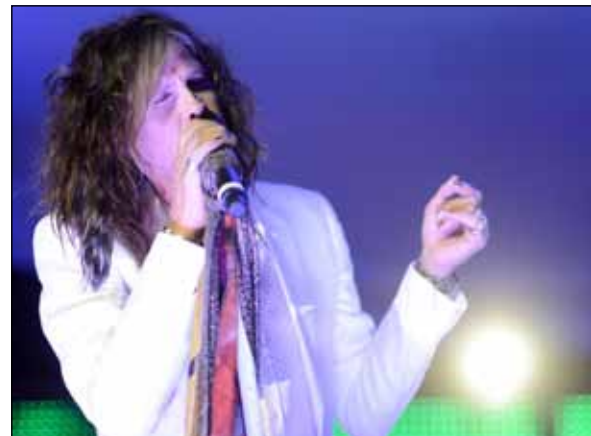
Steven Tyler (Aerosmith)