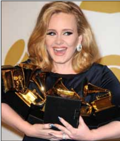
Adele at Grammy Award