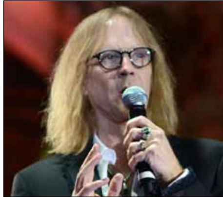
Tom Hamilton (Aerosmith)