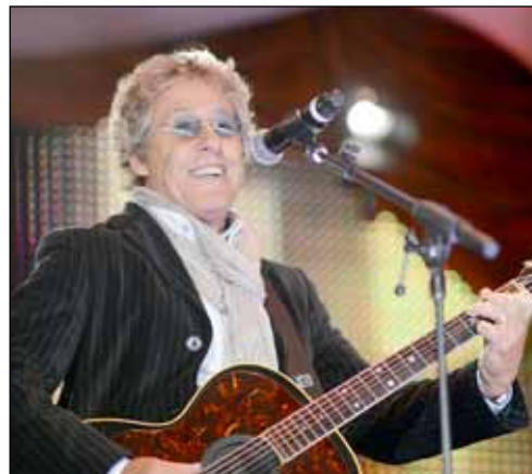
Roger Daltrey (The Who)